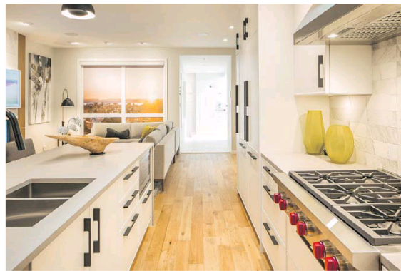
Penthouse features and finishes on display at the Bellewood Park Presentation Centre.

Visit the Bellewood Park Presentation Centre: 1010 Fort St., Victoria, BC T 778.265.3464 bellewoodpark.com Open Saturday - Wednesday Noon - 5pm